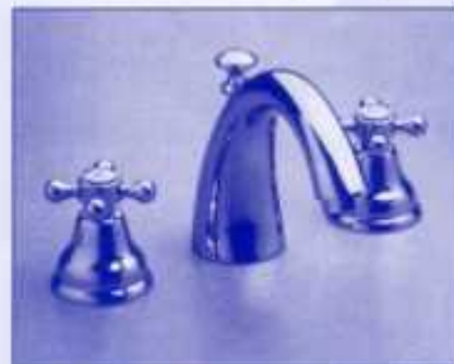
Art. 808/N Three Hole Washbasin Mixer with Pop-Up-Waste 1.1/4"