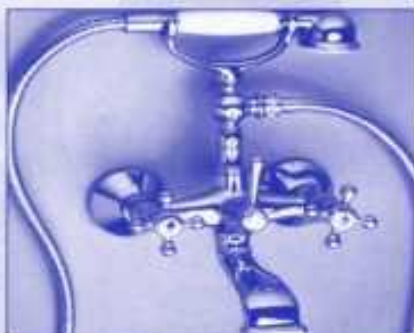
Art. 854/N Bath and Shower Mixer with Shower-Set