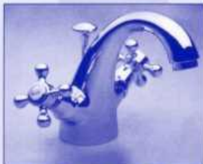
Art. 805/N Single Hole Washbasin Mixer with Cast Spout and Pop-Up-Waste 1.1/4"