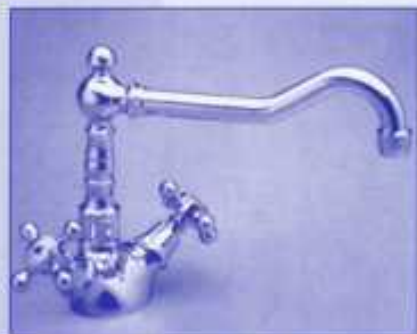
Art. 853/N Single Hole Washbasin Mixer with Nostalgic Swivel Spout and Pop-Up-Waste 1.1/4"