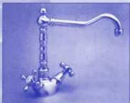
Art. 850/N Kitchen Sink Mixer with Nostalgic Spout