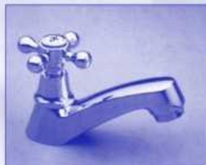
Art. 852/N Pillar Top