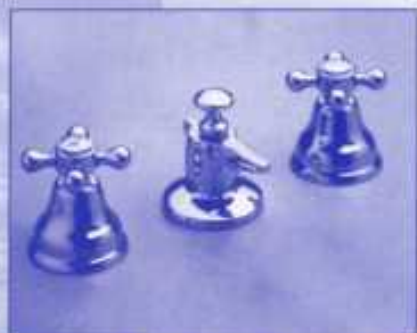
Art. 809/N Three Hole Bidet Mixer with Diverter Rimspray/Shower and Pop-Up-Waste 1.1/4"