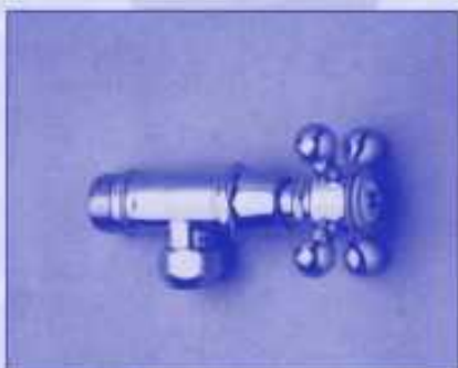
Art. 112/N Nostalgic Angle Valve 1/2" x 1/2" or 1/2" x 3/8"