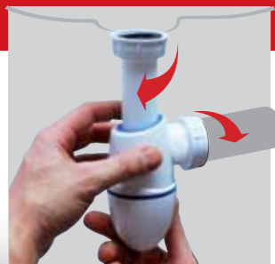
Easy to install «Adjust, tighten, done»