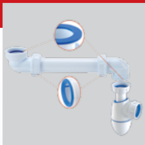
Space-saving solution with the washbasin rear pipe