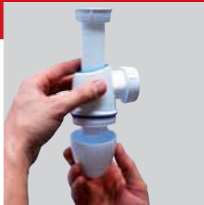
Quick and easy maintenance «Remove, rinse, reassemble»