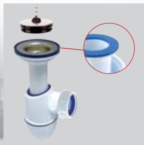
Washbasin co-injected waste