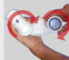
Double-rotating 360° trap